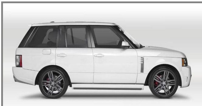
Base Vehicle Specification (Before Overfinch Conversion)